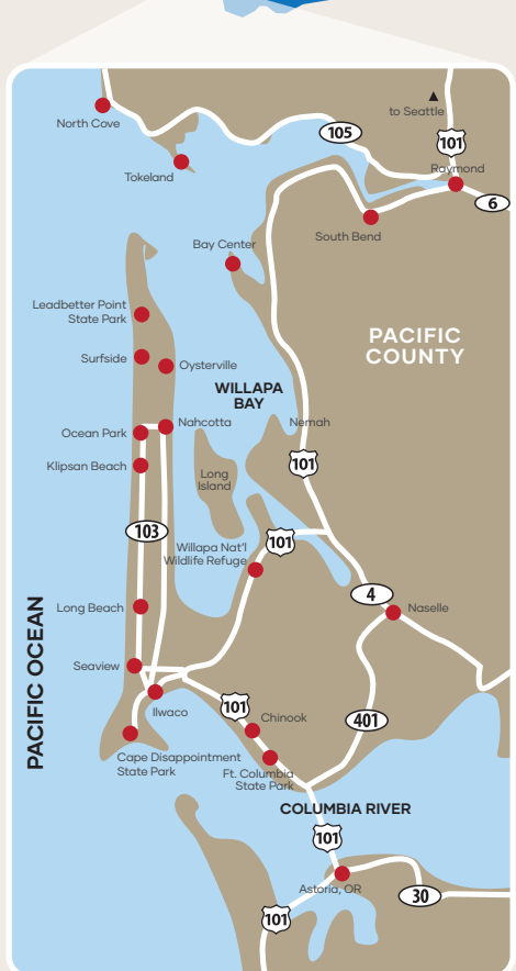
Visit Long Beach Peninsula.com